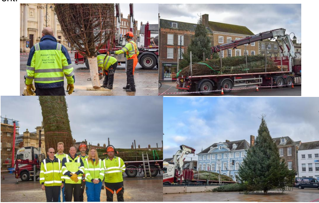
Please check our website for further information

The team are very busy this week with the preparation works ahead of this event.